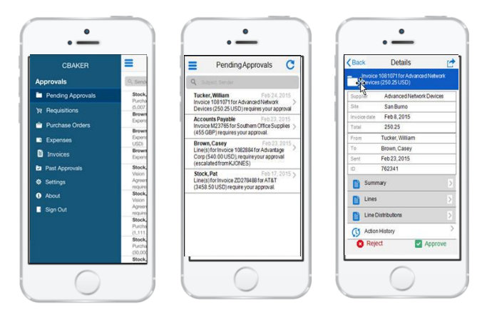
Figure 2: View and approve Payables Invoices using E-Business Suite Mobile Application